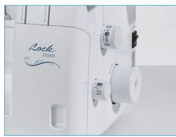
Easy access controls