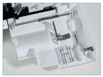
Built-in accessory storage