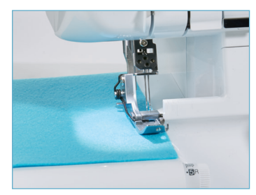
LED work light