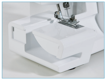
Free arm / Flat bed convertible sewing surface