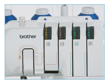
4 colour easy threading guide