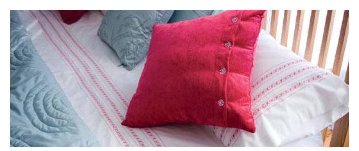
*All projects made on Innov-is products featured in this leaflet

even create mirror images of stitches via the easy to use keypad.